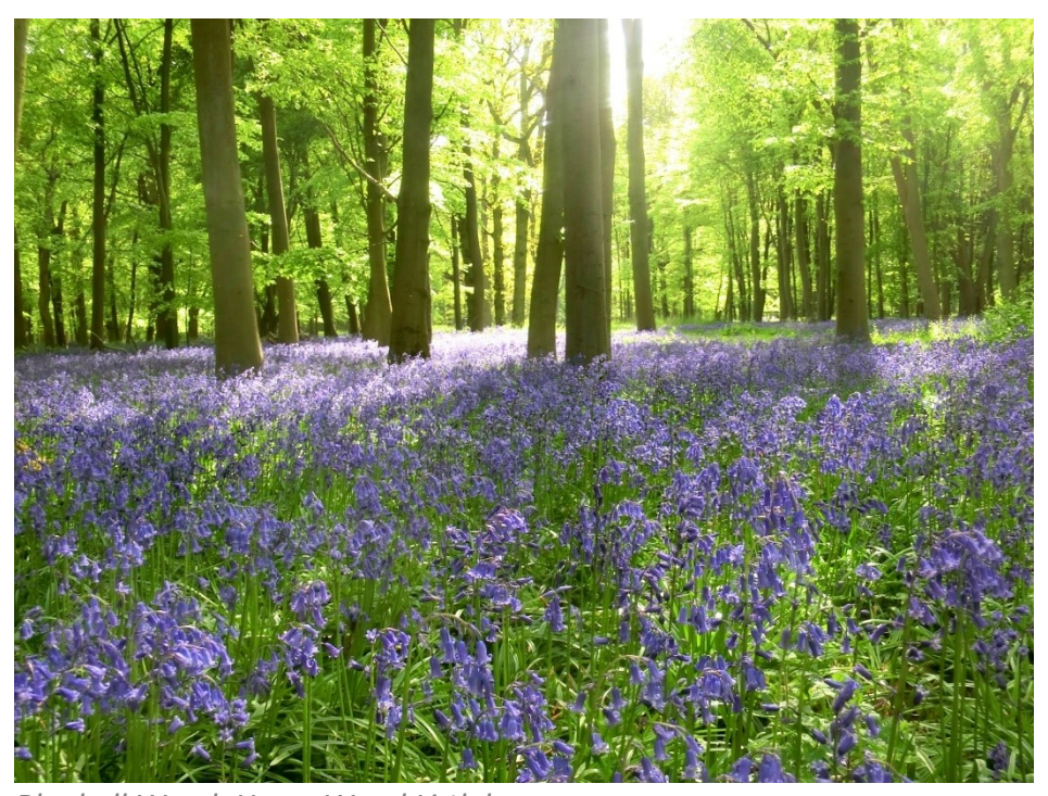
Bluebell Wood, Howe Wood Littlebury