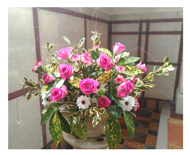
More Flower arrangement pics after Easter - Thanks Isabel