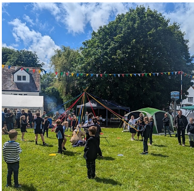
Maypole Dancing by Ashdon School Pupils at Hadstock Fete on 15 June. Helped by some parents holding the Maypole.