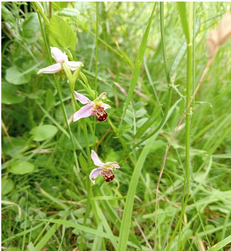
Beautiful Bee Orchids