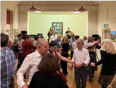
Dancing to the Lairds band