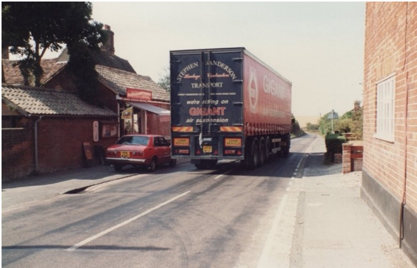
Heavy lorry passing the village stores and Post Office in Hadstock in the 1980s

In the mid-80s, the Society's turned its attention to road safety and the need for signage to reduce traffic speeds through the village. Working with the Parish Council, signs were eventually erected in 1989 on the Linton Road approach and later, on the Walden Road. The Society opposed a planning application to increase the lorry movements from the airfield industrial park, and in 1992, welcomed the Highways Authority decisions to restrict lorry weights to 17.5 tons from the airfield, and to remove the road sign on the A1307 in Linton directing lorries to Walden via Hadstock.