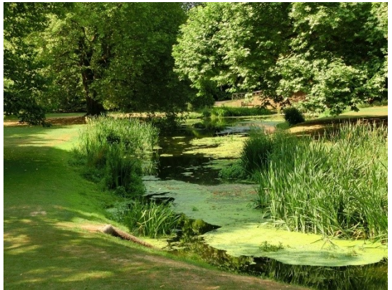
4. Audley End Gardens---