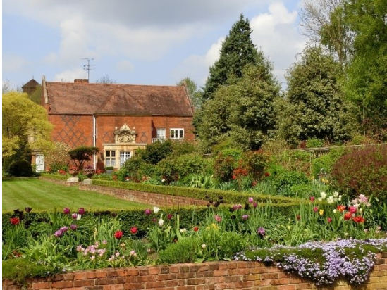
3. Gardens of the Eastern Lodge