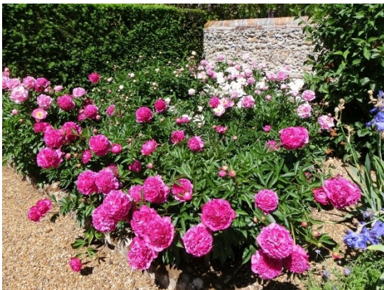
5. Ashdon Open Gardens