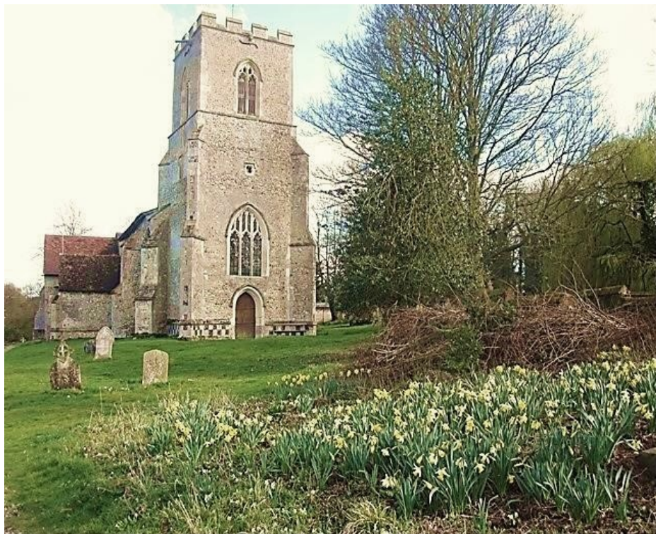
ST BOTOLPHS DAFFODILS