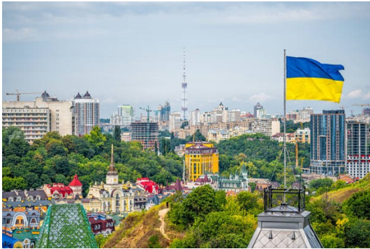
Ukrainian Flag flying over Kyiv city.- Before

It seems so incongruous to be in our beautiful, cosy, gentle Hadstock when not many hours away from us the world is being shaken up and may never be quite the same again. I cannot believe that it is actually happening. The poor people being interviewed on the radio seem so young with young children and don't know where to go or what to do for the best or even if they can get there. Sounding so tearful and shocked that their voices are trembling- like a bereavement.