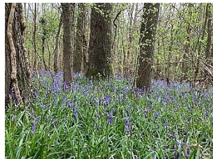
Bluebells! Of the month?

Are you feeling more positive? Do you feel we are getting back to more like normal again? Have you had your haircut? Are you feeling brave or more inclined to take the unlocking of our lives more slowly? For me it varies from day to day and I've noticed that I feel much braver when the sun shines!