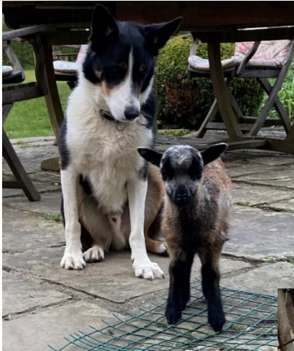
Malteser with her toy