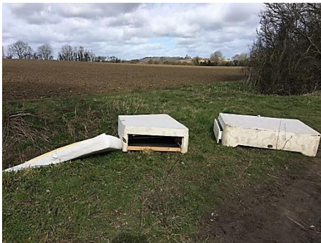
recycle site Snell

I saw the divan for the first time on Friday about halfway along the bridleway to Linton the culprits must know the track to have driven that far along, knowing they could turn around, before dumping it there as cannot be seen from the road.