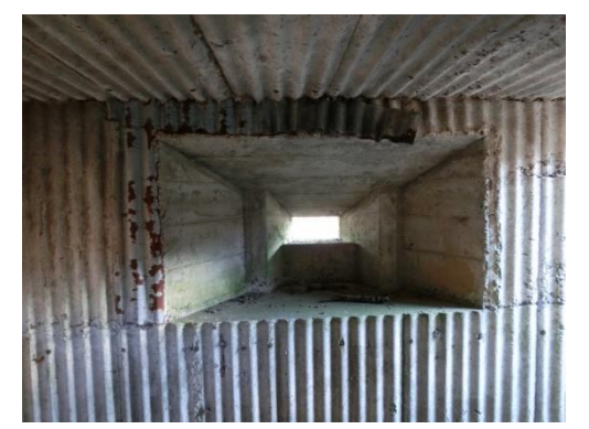
Pillbox -a view from inside one near Littley Green

Pillbox at Wendens Ambo beside the Fighting Cocks pub