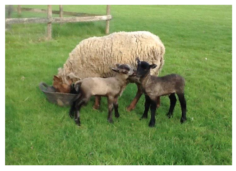
There is one more Ewe due to lamb so do keep looking if you're walking past. Lou