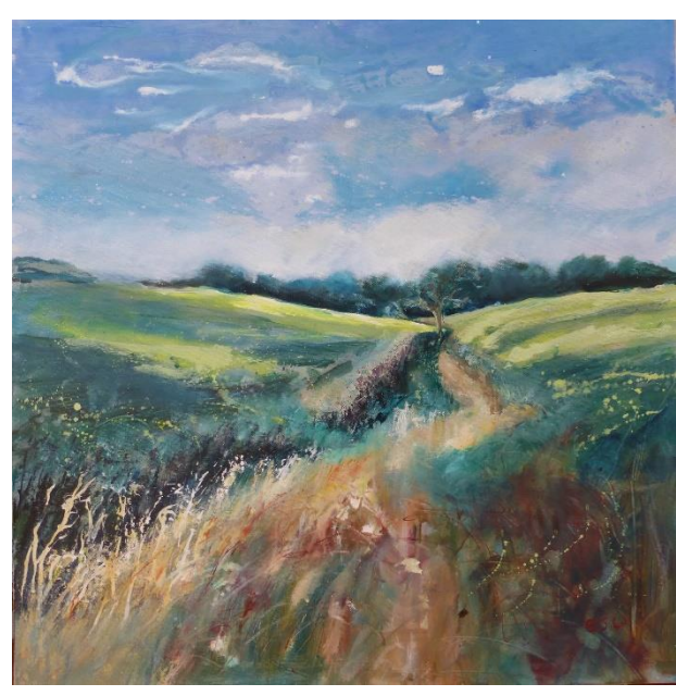
Spring in the Air