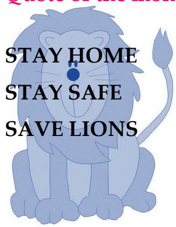
Thanks to Victor, aged 2.11/12 ths.